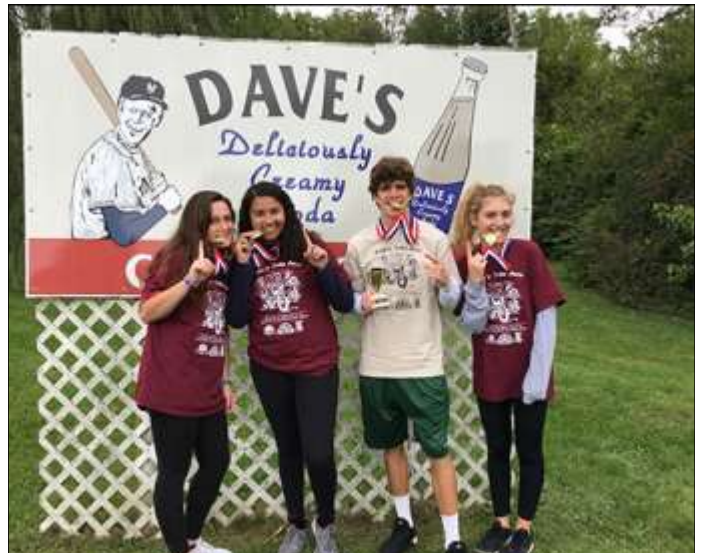
These are student winners of the last Brian's Trike Race. See how happy they look? Wouldn't it be swell to see a high school from your District here?

Call me or one of your District's Indiana Lions for the ISBVI trustees if you need help or have questions and with any registrations. You may also redirect any questions from the schools or students to me.